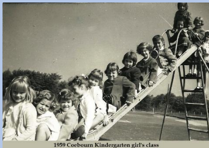
1959 Coebourn Kindergarten girl's class

We need your help to identify the who in these pictures by emailing to: historicalcmt19015@brookhavenboro.com .