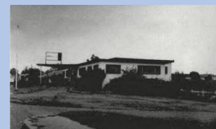
Photo of WEEZ studios just prior to demolition

In early 1950, Radio station WPWA whose broadcasting and transmitting headquarters were located in Brookhaven was granted a permit for the construction of 2 new towers. Station owners explained how the new equipment would allow them to broadcast after the sun went down without interfering with other stations broadcast. They wanted to focus on broadcast sports events and other local events, many of which took place at night, and the installation would allow them to broadcast from 6AM until midnight with the ultimate goal of broadcasting 24 hours a possibility.