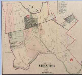
This 1934 partial map of Chester Township hangs in the main office of the Brookhaven Municipal Center.

The map shows the 1.69 square miles of the Brookhaven section of Chester Township that had a small area of residential homes concentrated in the area west of Brookhaven Rd. and north of Edgmont Avenue. ① This neighborhood is fondly known as Old Brookhaven and includes: Barlow Ave., Church St., Grandview Ave., Houston St., Maple Ave., Ridge Blvd., Seiger St., Virginia Ave., Wellington Ave.